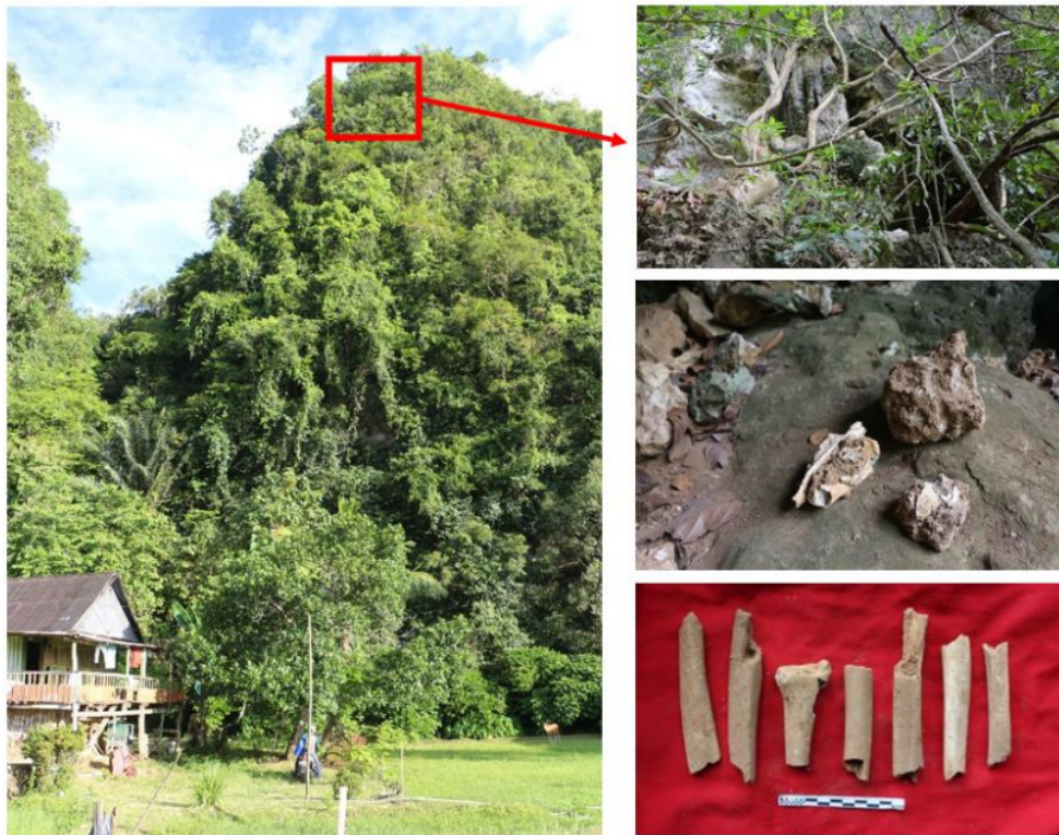
Figure 2. The condition and position of Leang Kado'4 Site on the top of a hill with some findings of human bone fragments some of which have experienced concretion and been associated with the pottery fragments found on the surface of the site. The red arrow shows the cave mouth covered with bushes and tree roots

burial tradition performed by the community around Lamoncong at the time (Bulbeck, 2004).