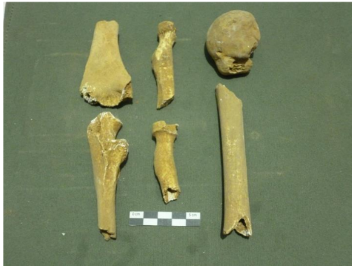
Figure 8. Some fragments of the upper extremity of ossa longum. Caput humeri (upper right) and caput radii (middle, upper, right) were used as the variables to determine sex. Os radius fragments were also used as variables to estimate height

with the Asian/Mongoloid and Australo-Papuan/Australomelanesoid populations.