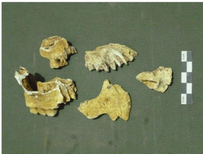
Figure 5. Fragments of cranium: maxilla and os zygomatic

fragment of the lower part of ramus mandibula (right). Of the fragments of the upper extremity of ossa longum , there are 3 fragments of os humerus consisting of 1 fragment of caput humeri , 1 fragment of corpus humerus fractured on the upper part of margo lateralis and without epiphysis distalis , and 1 fragment of corpus humeri ; 2