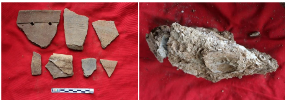
Figure 3. The pottery fragments associated with the human skeletal fragments. They seem to have experienced concretion and merged with the precipitating soil matrix at Leang Kado'4 Site

Archaeologically, these human skeletal findings are associated with the