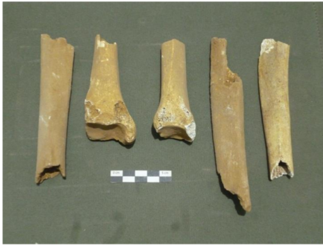
Figure 4. Fragments of the lower extremity of ossa longum ( os tibia ) .

fractured molar; and 2 fragments of os zygomatic , one of which is the right side (Figure 5). Of the mandible fragments, 1 fragment is a half part of mandible (left) fractured in the middle of area of trigonum mentale ; 1 fragment of a half part of mandible (right) with no ramus mandibula ; 1 small fragment of the alveolus ; and 1