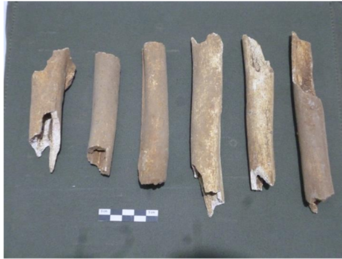
Figure 6. Fragments of the lower extremity of ossa longum ( os femur ) indicating the minimum number of 6 individuals

fragments of os radius with caput radii until a small section of the lower part of tuberositas radii , and 1 fragment of caput radii ; and 1 fragment of the proximal-side ulna fractured 3 cm under tuberositas ulnae .