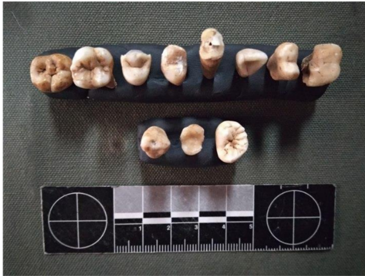
Figure 7. Isolated teeth found in Leang Kado' 4. At the top row are maxillary teeth, and at the bottom row are mandibular teeth. Several teeth were used to identify the population affiliation

variabilities in the morphology of crowns. Some Chinese populations have incisors without shoveling, while some Australian Aboriginal populations have incisor shoveling. Meanwhile, the occlusal molars of several individuals of Sahul Pacific were found without metaconule characteristics, while those of some Chinese populations have them. The analysis and determination of every variable of the human race need large samples, so that reliable comparative data can be obtained. Regarding this, we would like to emphasize that the size of the samples that we analyzed is very small and the samples may not or even does not represent the population.